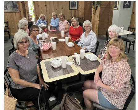
Lunch at Tappas, May 8, 2024

We hope to see you there on the 12th at 11:30 a.m.